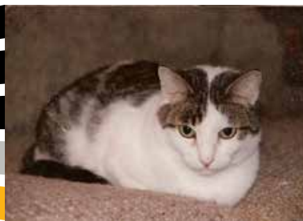
The author's cat Slick, who inspired her to become a VTS.

When I was at a point in my career when I was thinking about what I wanted to do, getting a VTS was at the top of my list. But I needed to think about which specialty I wanted to pursue. Nutrition has always been my passion. There is one patient that confirmed my passion for nutrition and made me realize this was what I wanted to specialize in. The patient was my own cat, Slick. I adopted Slick when he was 4 months old and he was perfect, no health issues at all. Unfortunately, at 1.5 years old he did not seem right. He did not eat half of